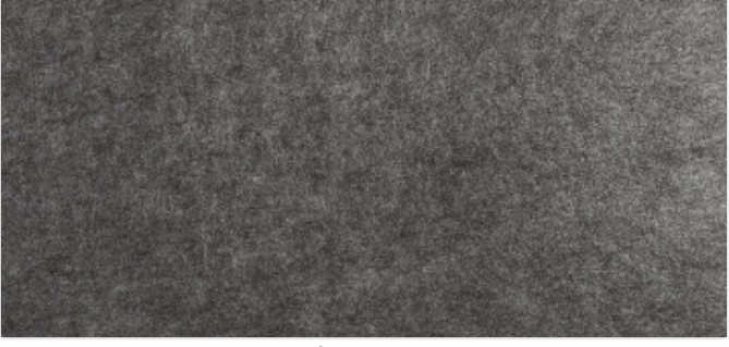
New 23cm x 56cm sample of Grippy Adhesive-Backed Floor Mat